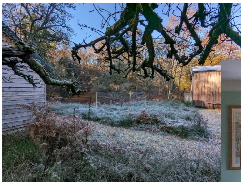
Frosty mornings at CC