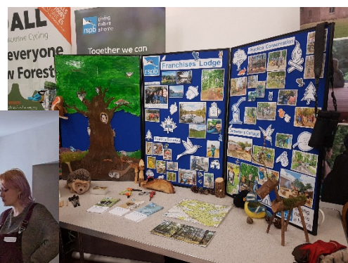
Our volunteer fair stall